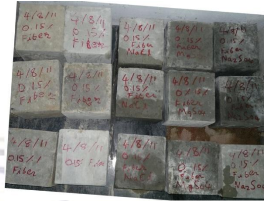
Fig1 C.C cubes without fibers

Mix proportions of conventional concrete:- As per IS 10262-2009 mix design for M30 prepared by trial and error and minimum water cement ratio decided for maximum compressive strength. After deciding quantity of each ingredients the casting of concrete as conventional and with different percentage of polypropylene fibers in moulds for compressive strength tests.